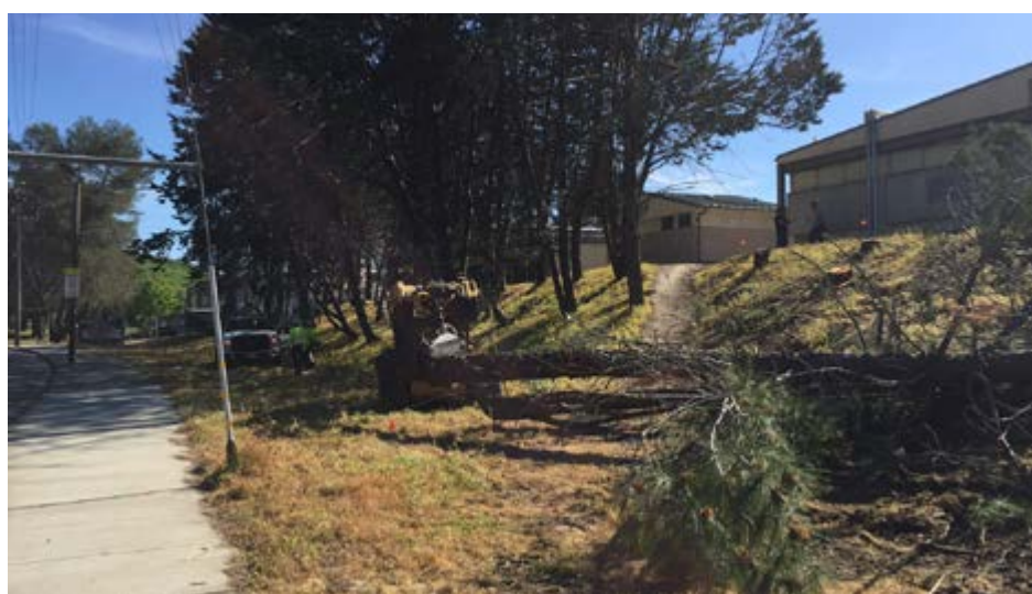
Trees are removed at Campolindo High School.

ree huggers have fewer trees to hug on after the Acalanes Union High School District removed 155 trees during the recent spring break, but the problem will be short-